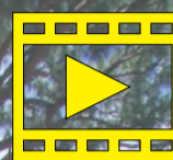
Film and Photography Club