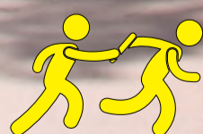
Track & Field