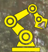
Stem and Robotics Club