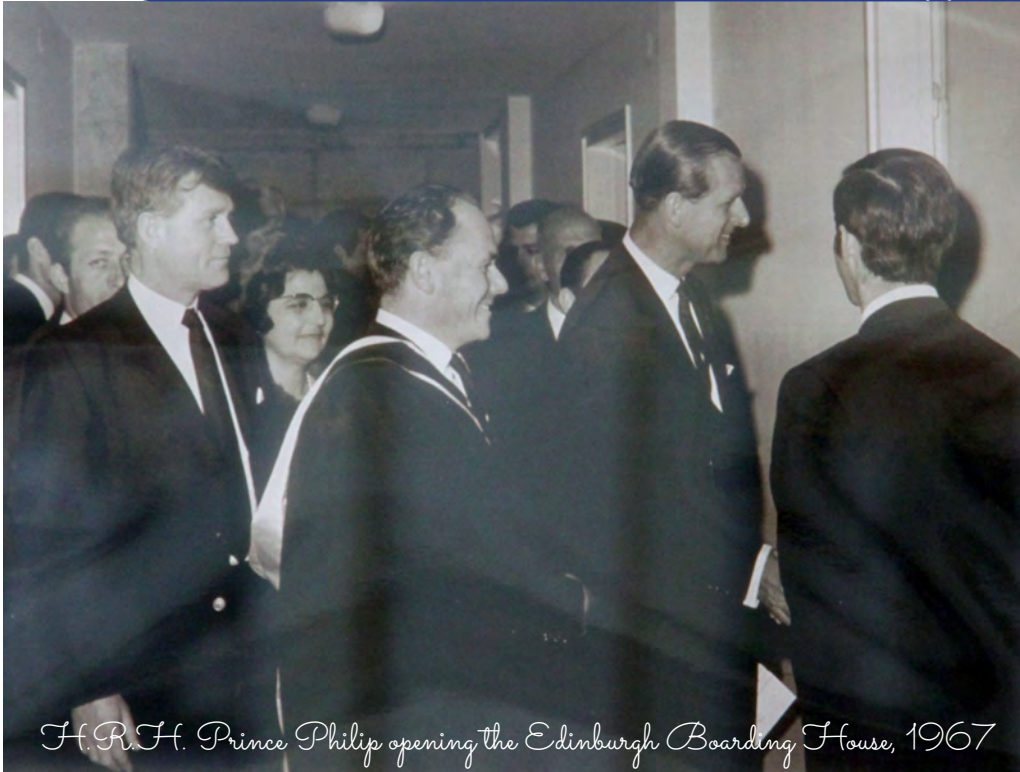
H.R.H. Prince Philip opening the Edinburgh Boarding House, 1967