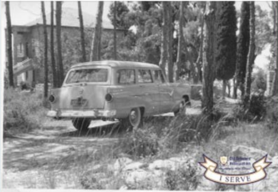
JUN '57 The school's car near Fleyssseh.